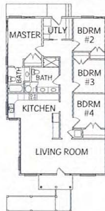
► Main Level

The cost of the project is estimated at $150,000. Thank you to the CWHBA membership and the community for supporting this project. For more information visit www.yakimalivesrebuilt.com .