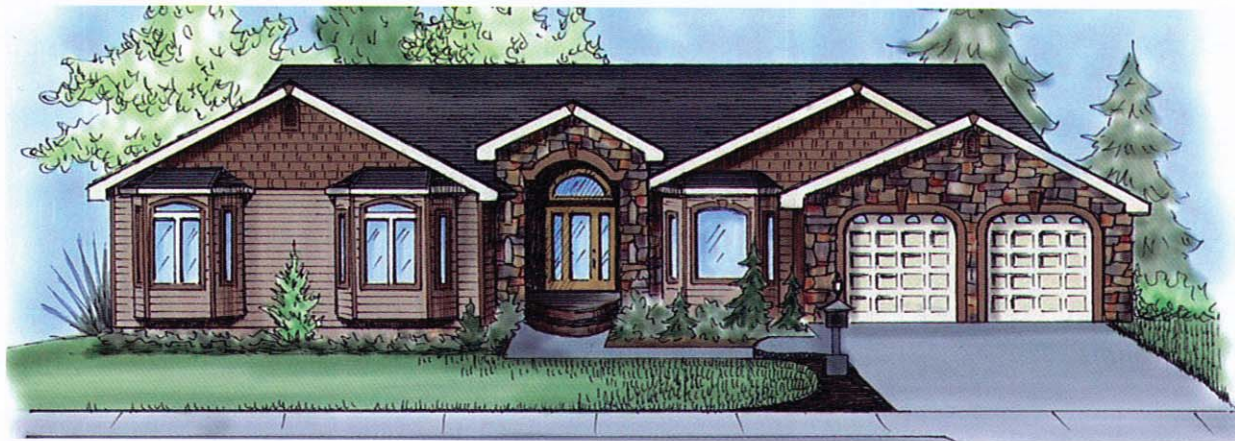
101 Heritage Hills Drive • Selah, WA

lower level from the spiral glass staircase you arrive in the Rec. Room which has a full wet bar, a work out area located in the tourit and a guest room with an attached bath. Or you can proceed on into the Theatre Room and Wine Cellar. Additional features of this spectacular home include a 6 car garage, a separate mud room with its own laundry facility and a 1600 square foot Cabana House for even more entertaining area.